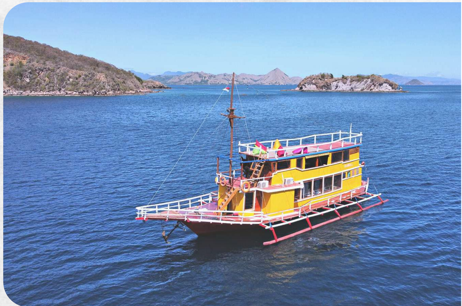
Rainbow Live A Board